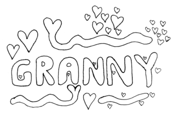
For Granny with love Noah